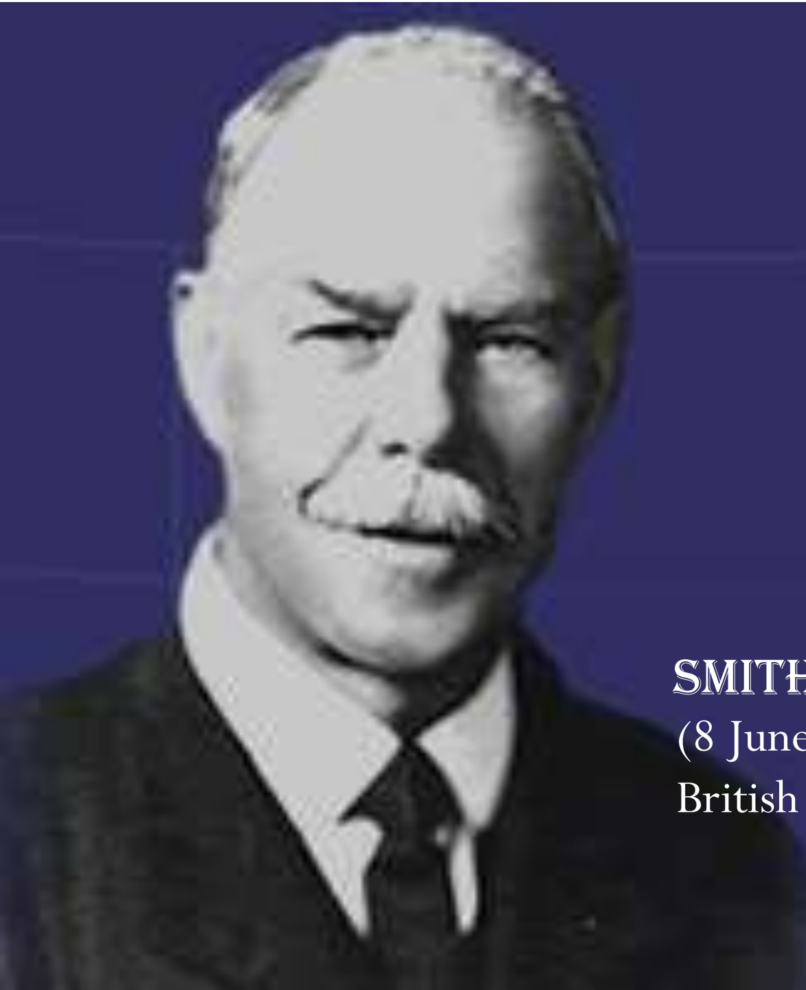
SMITH WIGGLESWORTH (8 June 1859 – 12 March 1947) British evangelist